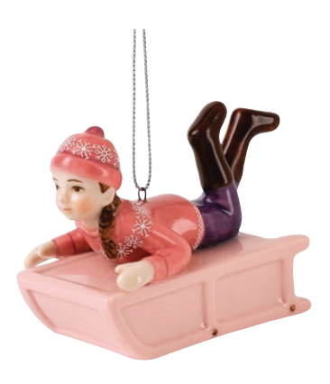
Sledge Height 6cm | 2502 012 AU $42.95 | NZ $49.99 Available July