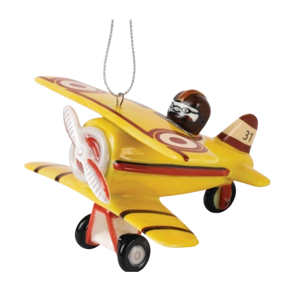
Aeroplane Height 6cm | 2502 011 AU $42.95 | NZ $49.99 Available July