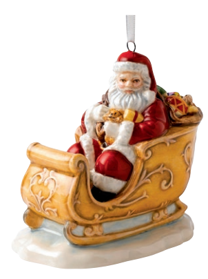
Santa and Sleigh HN 5708

Height 8cm | 2907 504 AU $35.95 | NZ $40.99 Available July