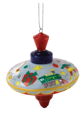
Spinning Top Height 7cm | 2502 013 AU $42.95 | NZ $49.99 Available July