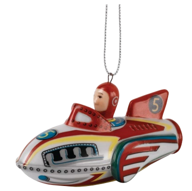
Rocket Height 5cm | 2502 014 AU $42.95 | NZ $49.99 Available July